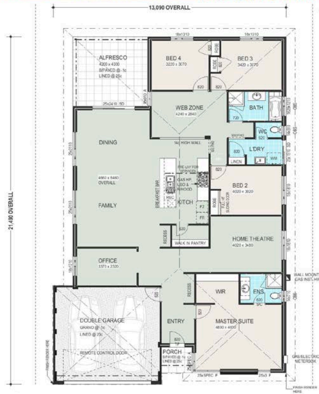
FLOOR PLAN 1:100 TO SUIT 15590m WIDE LOT